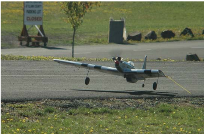
Herb Reidlinger's P-51 lands after losing it's wing in flight

Lord flying his big electric powered Fokker fighter finished in a tie for first place. Dave