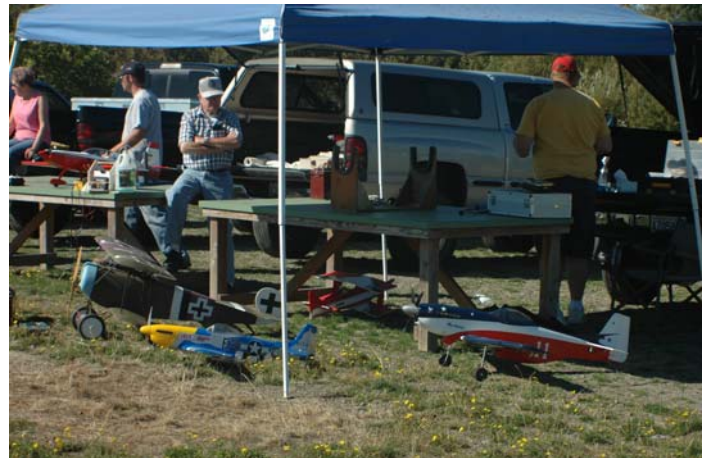
Planes lined up and ready to take to the air at the scale event

Herb showed us his VTOL plane that he is working on. He stated the plane has a few flights on it and he is getting close to where