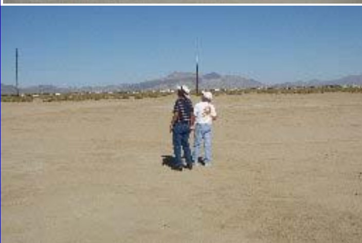
Winter Flying Conditions in Pahrump, Nevada.