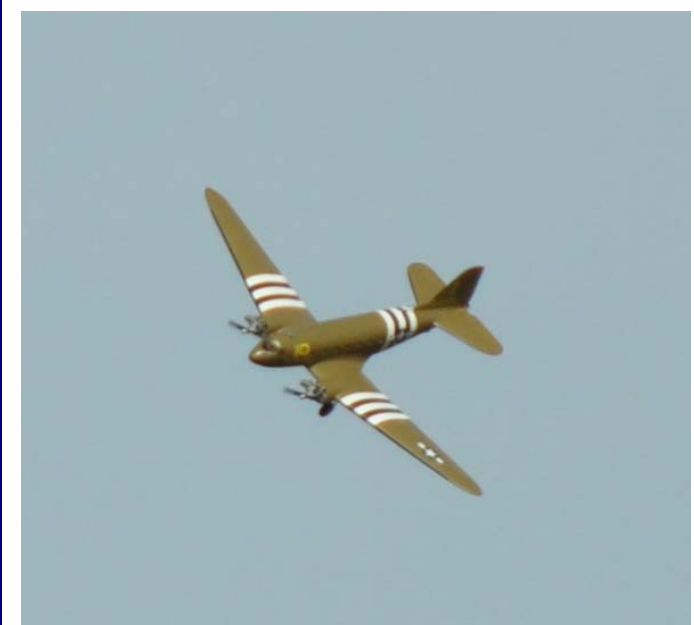
Ed Hagedorn's Top-Flite C-47 Turning for Final