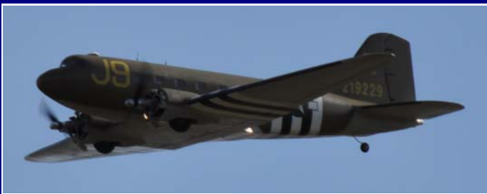
Ed Hagedorn's Top-Flite C-47 in Flight