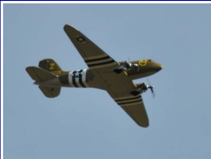
Ed Hagedorn's Top-Flite C-47 in Flight