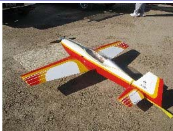
Chuck Murray's Composite ARF, it has an 85 inch wingspan and a DA 50 for power.