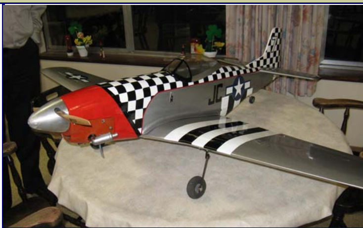
Tom O'Neal's Top Flight P-51 He built up the wing from a foam core

Clearly, it is very important to always use a balancer when cell capacity is no longer in balance. It is also important to cut your flight time shorter. It should also be obvious now that, while a LiPo balancer can keep cell voltages in balance during the charge process, it cannot re-balance the capacity of each cell in the pack. I have LiPo batteries that I've used for two or three years that the balancer tells me I don't need to balance. I have never charged then with a balancer. A well balanced LiPo pack will keep itself in balance without need of a balancer. However, a LiPo pack whose cell capacity is out of balance must be charged with a balancer every single time it gets charged. It is also important to use a timer so that you can land before flight symptoms indicate the pack is running out of gas. Such precautions are very important unless the cost of batteries is of no concern to you.