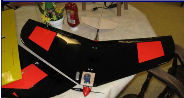
Herb Reidlinger's Pattern Racer Contact Herb if you are interested in getting into this exciting flying discipline